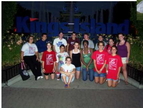
Kings Island Trip